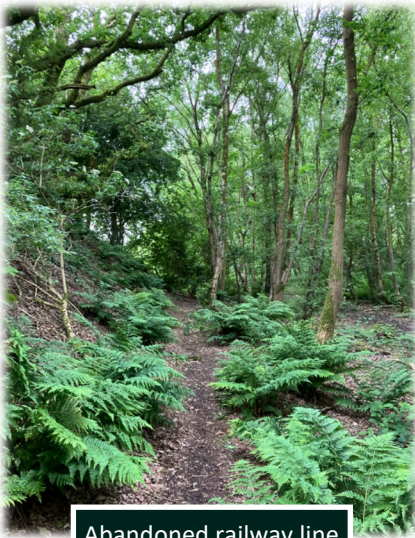
Abandoned railway line

“Skem Jazzer” was a nickname given to the service on account of Skelmersdale’s popular jazz concerts of the time. It is never likely to be revived because the rail link to Ormskirk has been abandoned for ever. More recent plans have focused on a link from Skelmersdale to the Wigan to Kirkby Merseyrail line, where a new station at Headbolt Lane in Kirkby is now open. A bus service (319) which stops on Neverstich Road, opposite to the duck pond on Old Engine Lane, takes passengers to Headbolt Lane.